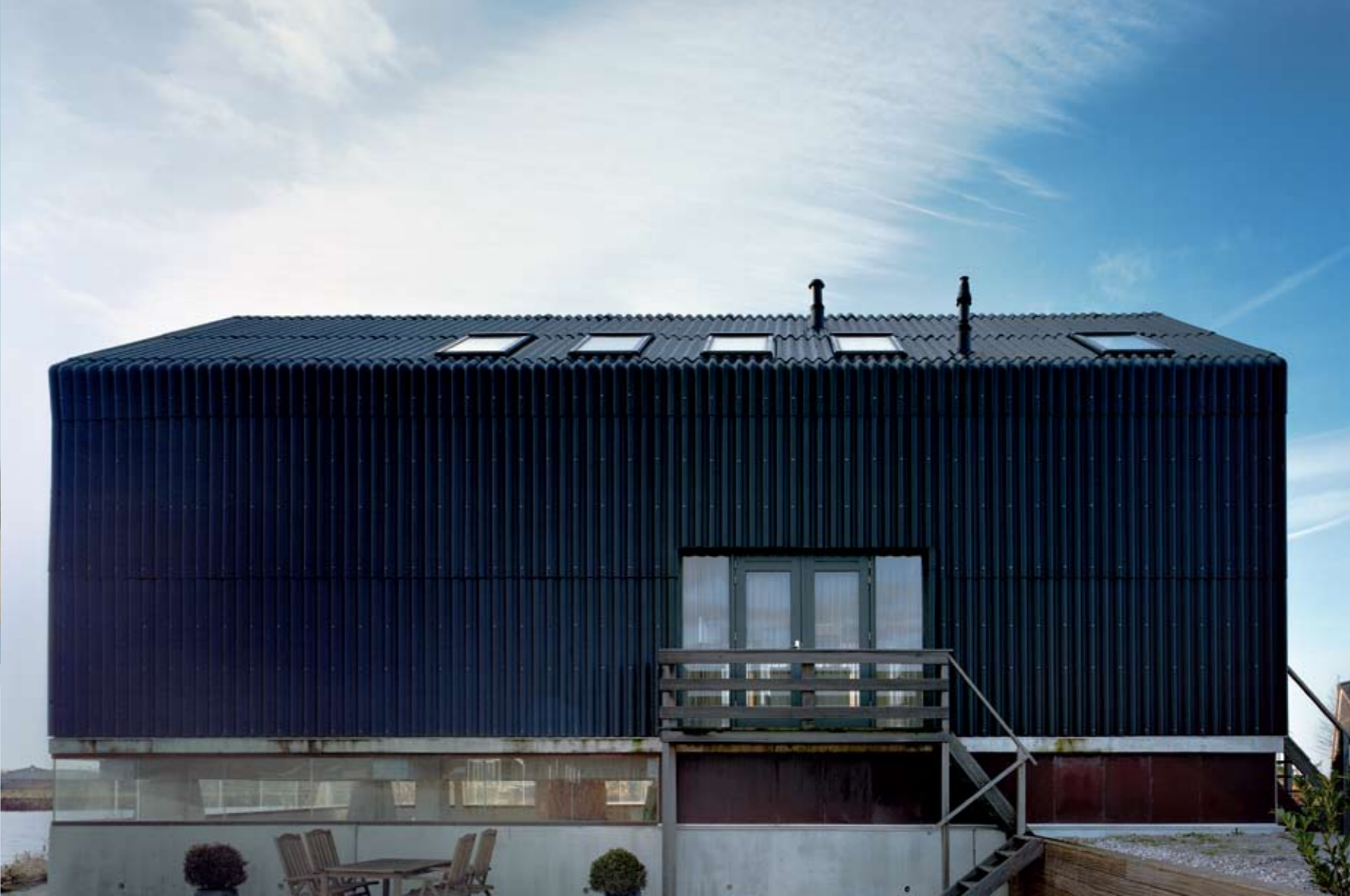
From left to right, from above to below: Exterior view to house within surroundings, interior view, view to basement and porch. Right: Detail façade.